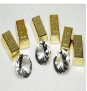
"An Evening of Elegance"